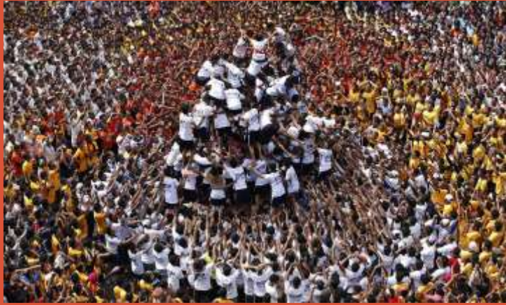
Figure 3: A group of Hindu's attempt to try to form a human pyramid to break a clay pot. This specific competition is called "dahi-handi"