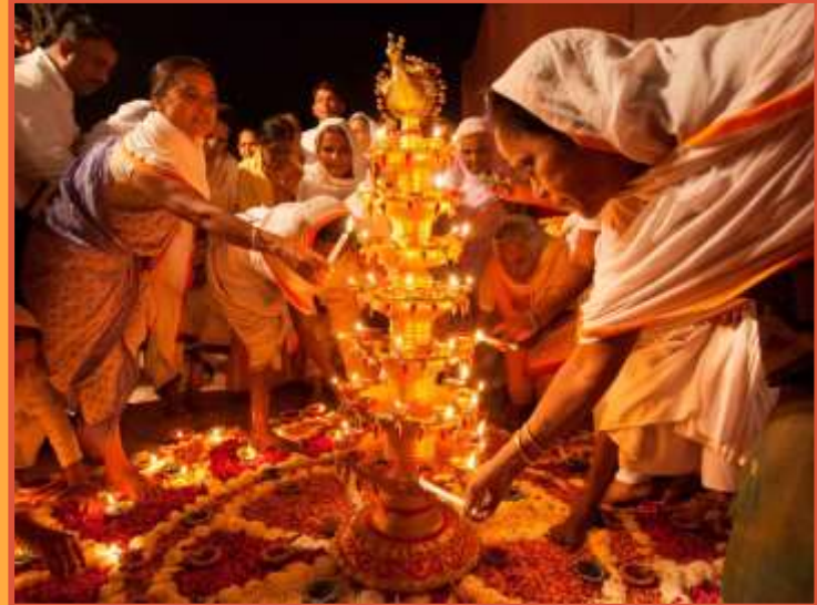
Figure 1: Hindu women lighting diyas on a large stand surrounded by other clay based lamps

Diya: An oil lamp made by clay or mud with a cotton wick dipped in ghee