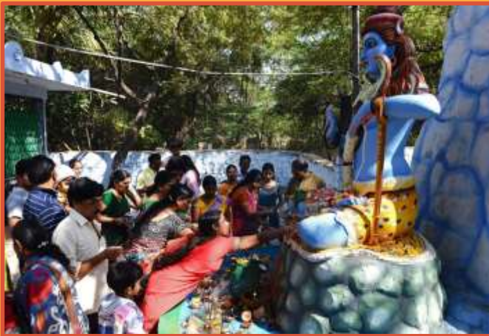
Figure 5: Hindus worshipping a statue of Lord Shiva