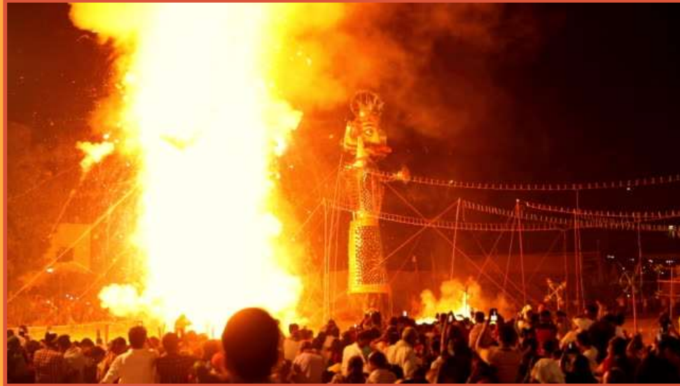
Figure 4: Effigies of Demon King Ravana being burnt in celebration of Lord Rama's victorious rescue and the defeat of Ravana.